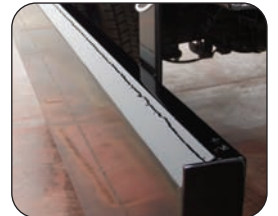
Fold Down Removable Sides with Dirt Shedding Lip