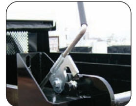
Simple, Robust Tailgate Latch