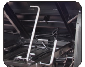
Sturdy Underbody with Integrated Safety Body Prop