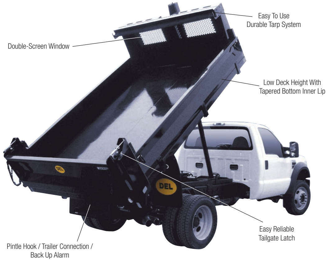
Pintle Hook / Trailer Connection / Back Up Alarm