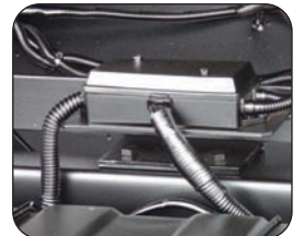
Water Tight Electrical Junction Box and Wiring Harness

Due to continuous product improvements, specifications may change without notice. Chassis available through DEL pool stock. Contact your local vehicle dealer for pricing and availability.