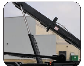
Forward Facing Tipping Cylinders for Better Lifting Efficiency