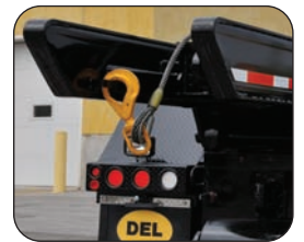
HSS Construction with Heavy Internal Reinforcement