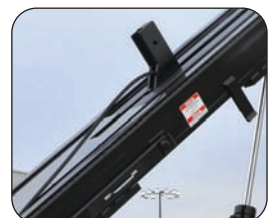
Pusher for Low Head Height Discharge Applications

Due to continuous product improvements, specifications may change without notice. Contact your local vehicle dealer for pricing and availability.