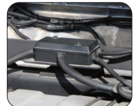
Water Tight Electrical Junction Box and Wiring Harness

Due to continuous product improvements, specifications may change without notice. Chassis available through DEL pool stock. Contact your local vehicle dealer for pricing and availability.