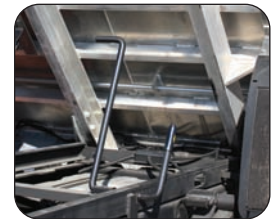
Sturdy Underbody with Integrated Safety Body Prop