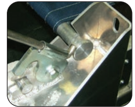
Simple, Robust Tailgate Latch