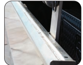
Fold Down Removable Sides with Dirt Shedding Lip